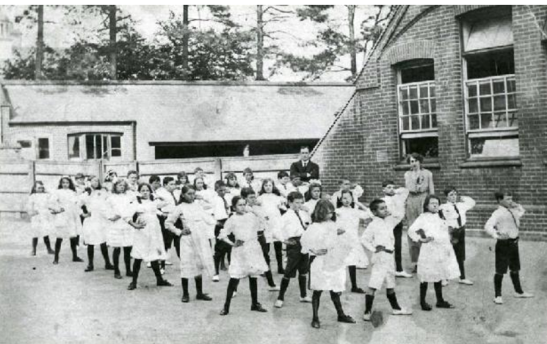
Chislehurst and Sidcup Hill School circa 1913-1918

A Primary School was built opposite my house in 1908 to accommodate the growing population. It was known as Chislehurst and Sidcup Hill Council School and it was rebuilt as Orchard Primary School in 2003.