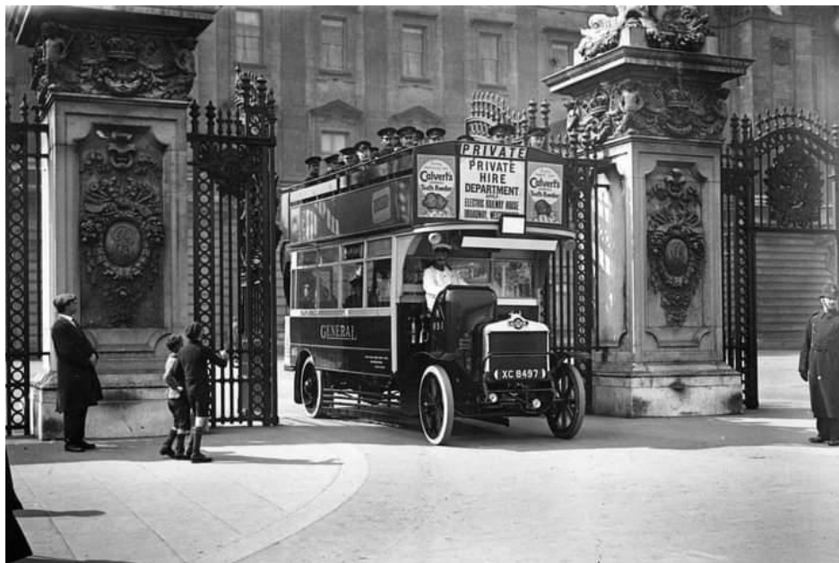
This is one of K-type London buses when brand new departing from Buckingham Palace circa 1920. It is understood that the soldiers on board had been for an audience with King George V in connection with their Great War service.