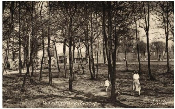
Waring Park in the early days.